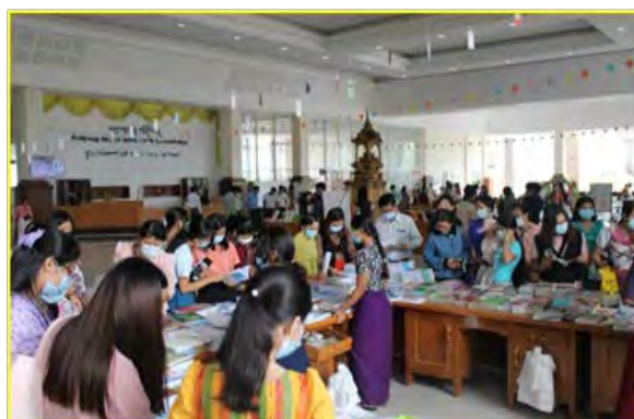
Children's Literature Festival, 2022, NPT