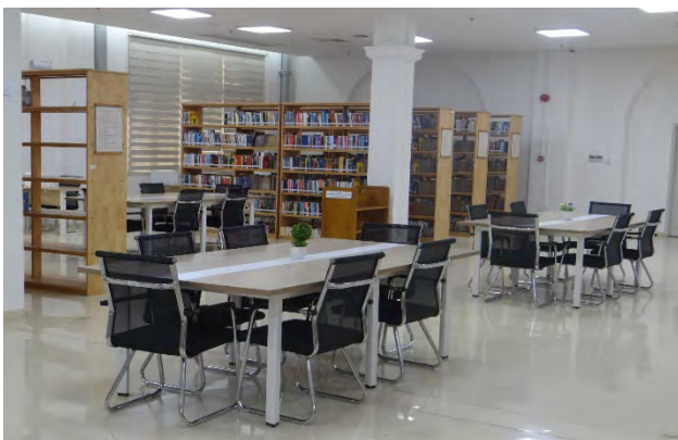
General Reading Room